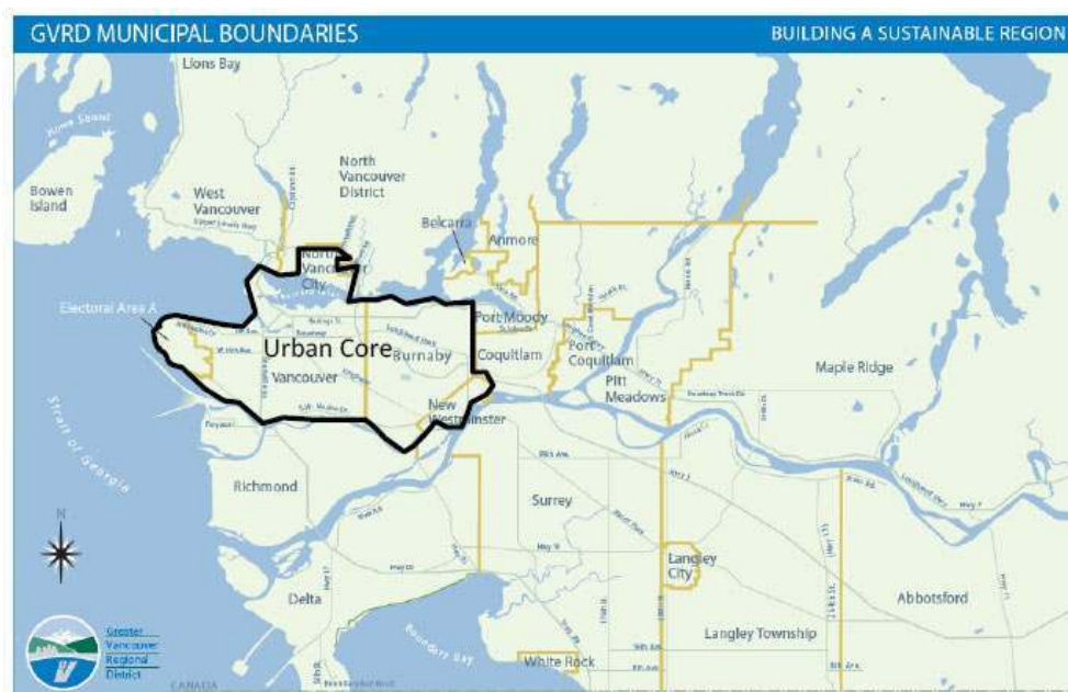
Figure 2. Metro Vancouver Municipalities

urban core and residents of the surrounding suburban municipalities. The majority of respondents identified the urban core as the cities of Vancouver, North Vancouver, Burnaby, and New Westminster (see Figure 2). Many respondents, including a number of academics, an urban affairs journalist, an urban mayor, and a transport policy analyst, felt that congestion was a major factor in determining behaviour, but indicated that this was much more likely to be true in the urban core than in the suburbs. Conflicting regional perspectives emerged as a major theme throughout the interviews.